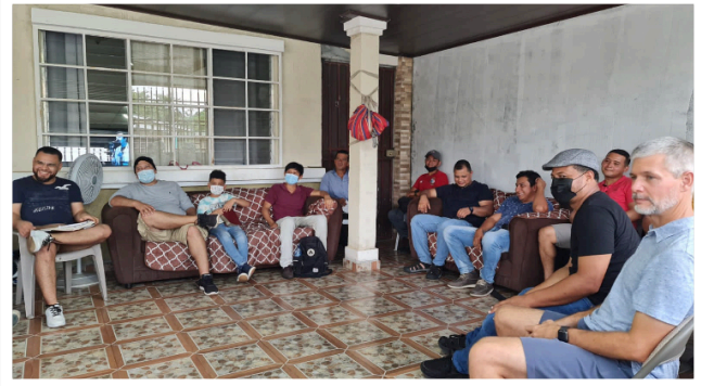
Most of the men who met at Nelson's house on December 4.