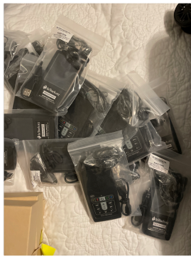
The audio Bibles that will be distributed in San Antonio.