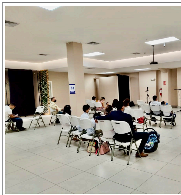
Photos of our church family from the service on November 29.